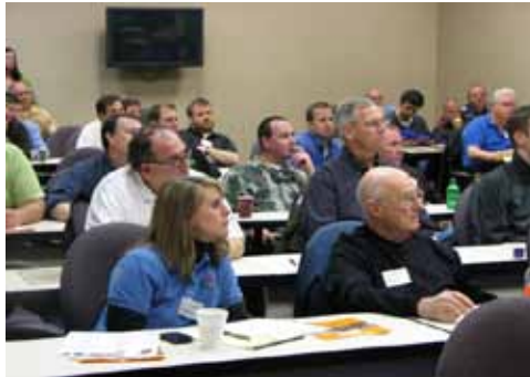
The room was packed for all the technical sessions; historical preservation was a hot topic.