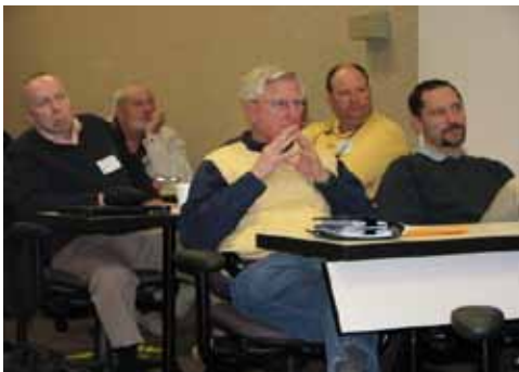
The audience was really focused on the presentations throughout the two days of the conference.